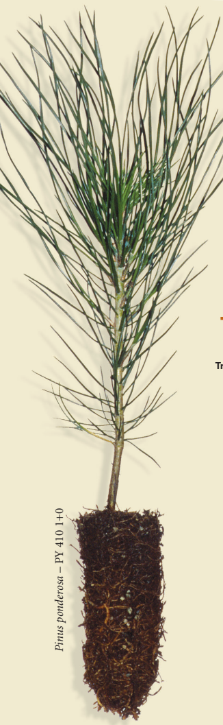
Pinus ponderosa - PY 410 1+0